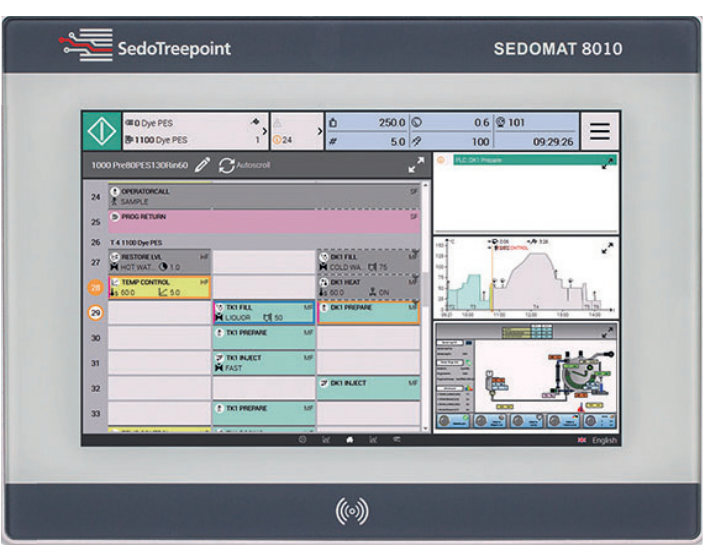
Sedomat 8010 ▲