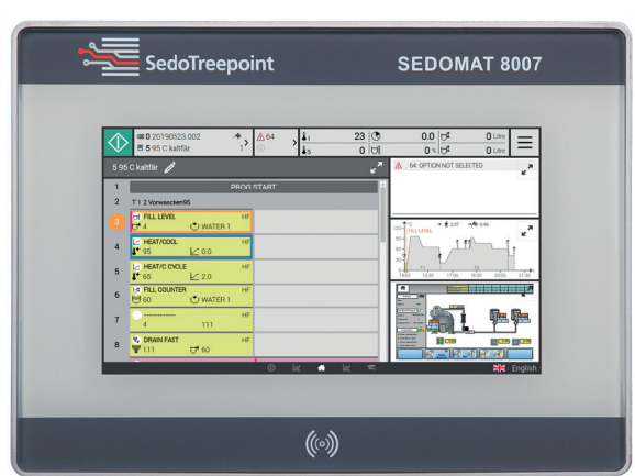
Sedomat 8007 ▲