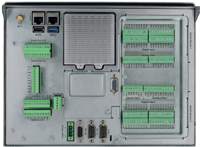
▲ Connections and interfaces Sedomat 8010

Head office: Sedo Treepoint GmbH, Germany Neuwies 1, D-35794 Mengerskirchen Phone: + 49 6476 31-0 sedo@sedo-treepoint.com